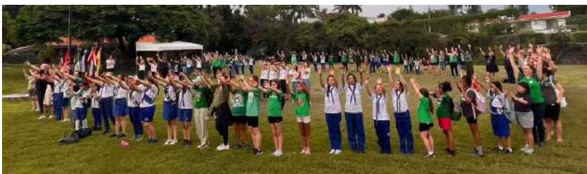
Opening ceremony (above); Camp Staff matching in orange (below)